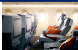
PREMIUM ECONOMY CLASS