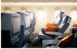
PREMIUM ECONOMY CLASS